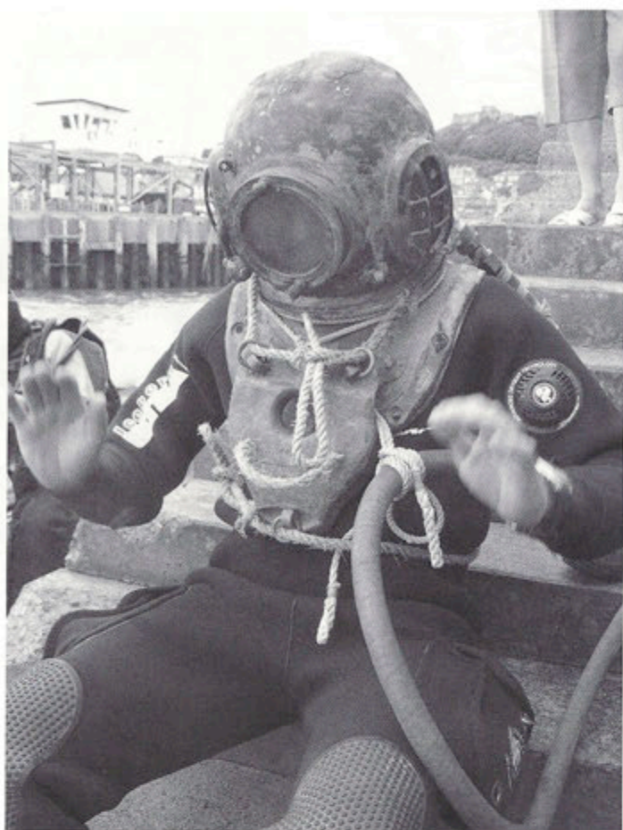
A Siebe about to be dived in open-helmet mode.

it really is as pretty as it looks) and the Scarborough Sub-Aqua Club.