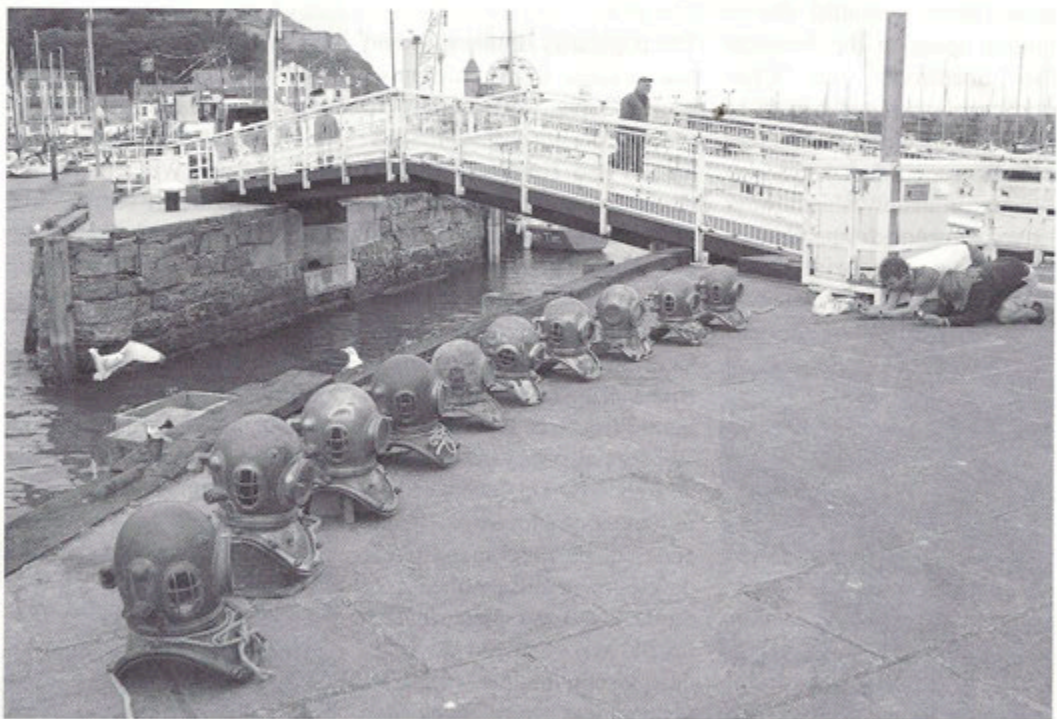
Any number of devotees paid homage to the helmets..... or were they only taking pictures?