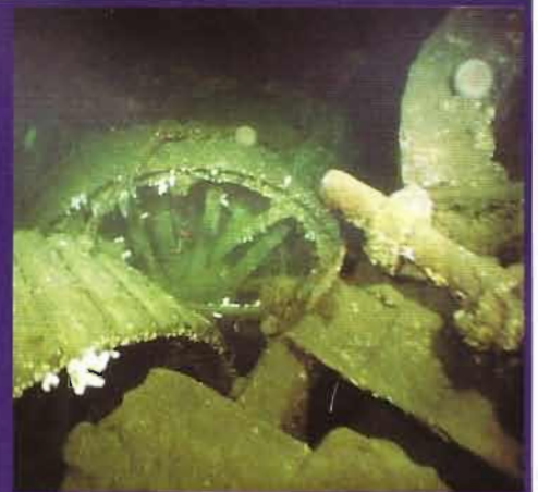
A jumble of wheels.