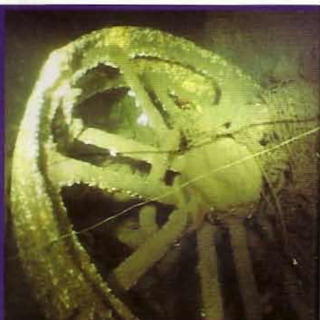
A wheel in the vicinity that has become separated.