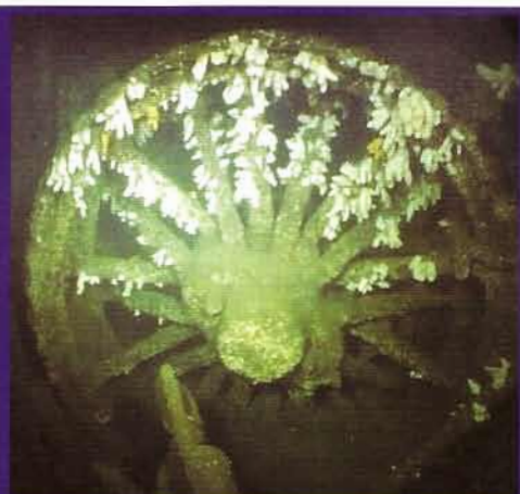
A wheel makes the perfect framework for marine life.