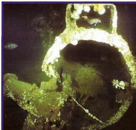
Some fish inspect a Fowler smokebox.

At the time of the dive in August, visibility was good and they videoed what they found, although at first they were not quite sure what to make of the jumble of