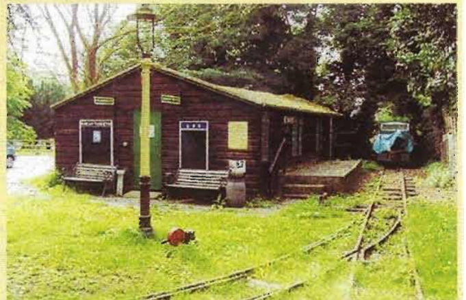
The 2ft railway and station in the grounds of Cadeby Rectory.

The estate sale is being managed by County Properties of Hinckley, Tel 01455 890898.