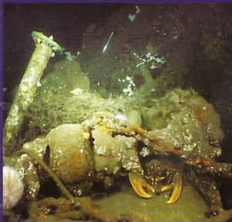
The engine provides a perfect hide-out for a lobster.